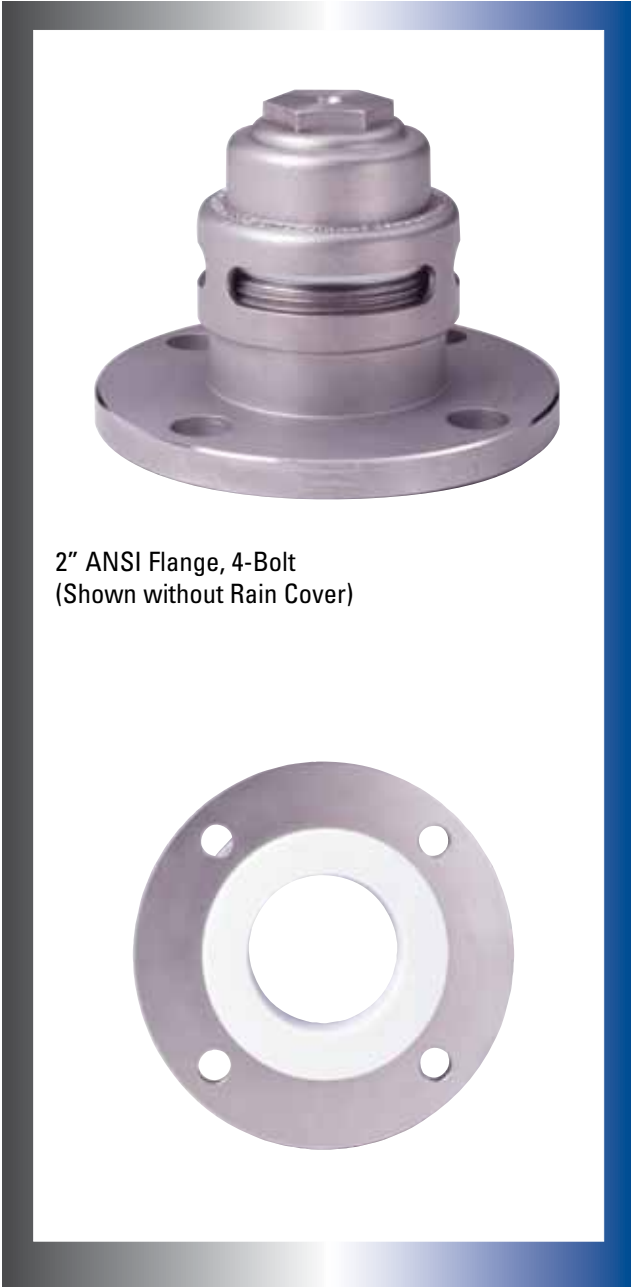
2" ANSI Flange, 4-Bolt (Shown without Rain Cover)