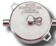
3" Blanking Cap (BSP) GE-3SC-BSP