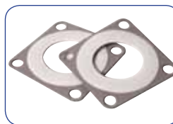
GQ70030 Butterfly Valve Flange Gaskets