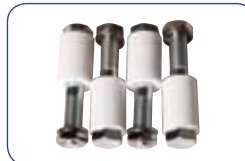
GE-300BK-CFV SS Bolt, Nut Washer, Nylon Spacers