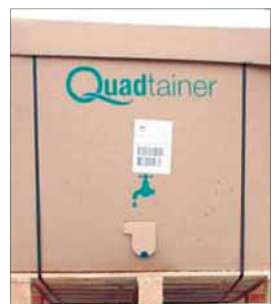
Quadtainer is designed to carry 1,000 litres of liquid

difficulty by one operator, and the company claims it is ideal for export and significantly reduces storage and handling costs.