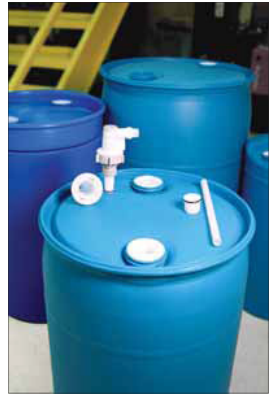
The DrumQuik PRO is claimed to minimise spills, fumes and environmental impact

The DrumQuik PRO system is made from virgin FDA approved materials and is available with EPDM, FKM, and even FFKM (Perfluoroelastomer) seal options. In addition, the coupler is available with