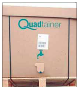
Quadtainer is designed to carry 1,000 litres of liquid

difficulty by one operator, and the company claims it is ideal for export and significantly reduces storage and handling costs.